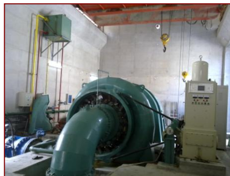
POWERHOUSE NO 1

Four cascade powerhouses development are planned. Water from the outlet structure is conveyed to the Powerhouse-1 through steel penstock. Powerhouse-2 is supplied water through open channel, forebay and steel penstock. An intake weir along Satpara nallah just downstream of Powerhouse-1 diverts water to headrace channel of Powerhouse-2.