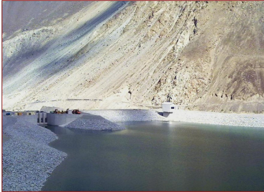
VIEW OF MAIN DAM