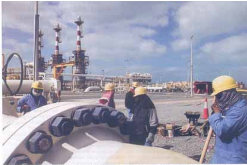
Recycling wealth Profits from Abu Dhabi's fossil fuel ventures, such as the gas line at Tawwelah, left, are funding the emirate's green initiatives.

Most significant of all may be Masdar City itself. While Abu Dhabi, like so many hurriedly built cities around the developing world, sprawls with little design and has almost no public transit, Masdar City will be as dense as a circuit board - a 2.3-sq.-mi. (6 sq km) walled community designed to be car-free and served by magnetic trains.