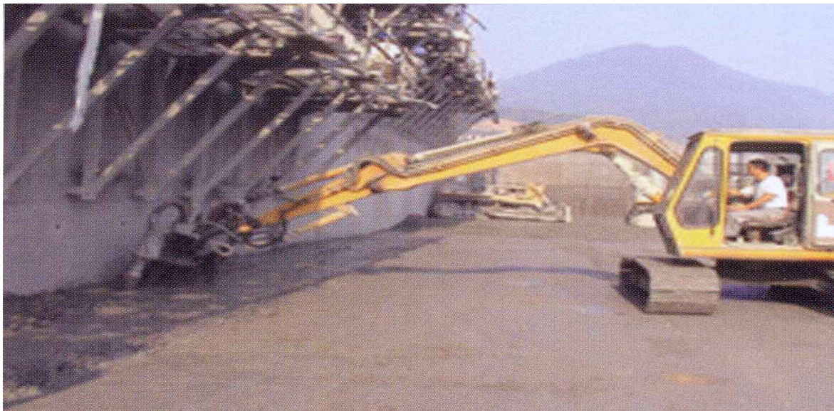
Figure 5: Pouring and Vibrating Process of GEVR The seepage control scheme developed at for Longtan RCC Dam combines GEVR and gradation II RCC. The GEVR Thickness varies between 0.5 m – 2m from top to bottom and the thickness of Gradation II RCC varies from 8m - 15m.

In the early design stage, the dam uses a seepage control combining reinforced concrete facing and gradation II RCC. Extensive research was conducted on impermeability of gradation II RCC and GEVR at Jiangya dam laboratory, including 102 specimens for laboratory seepage test of RCC cores. It is determined, based on the research, that the upstream seepage control of all RCC sections of Longtan Dam are built with Grout Enriched Vibrated RCC (GEVR) and gradation II RCC.